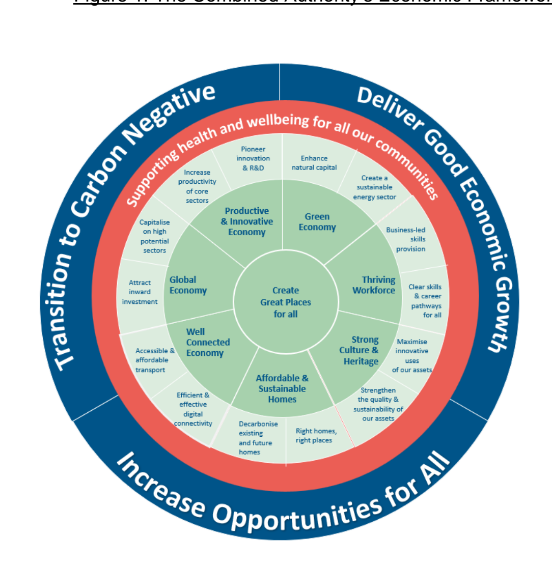
Figure 1: The Combined Authority's Economic Framework

15. To note, in response to the Mayor's pledges, an initial, high level overview of key priorities has been developed by the Combined Authority that builds on the economic framework. This is presented in a paper at the Combined Authority on 31 May and is shown below as Figure 2. The York pipeline will seek to reflect the priorities identified and others that emerge.